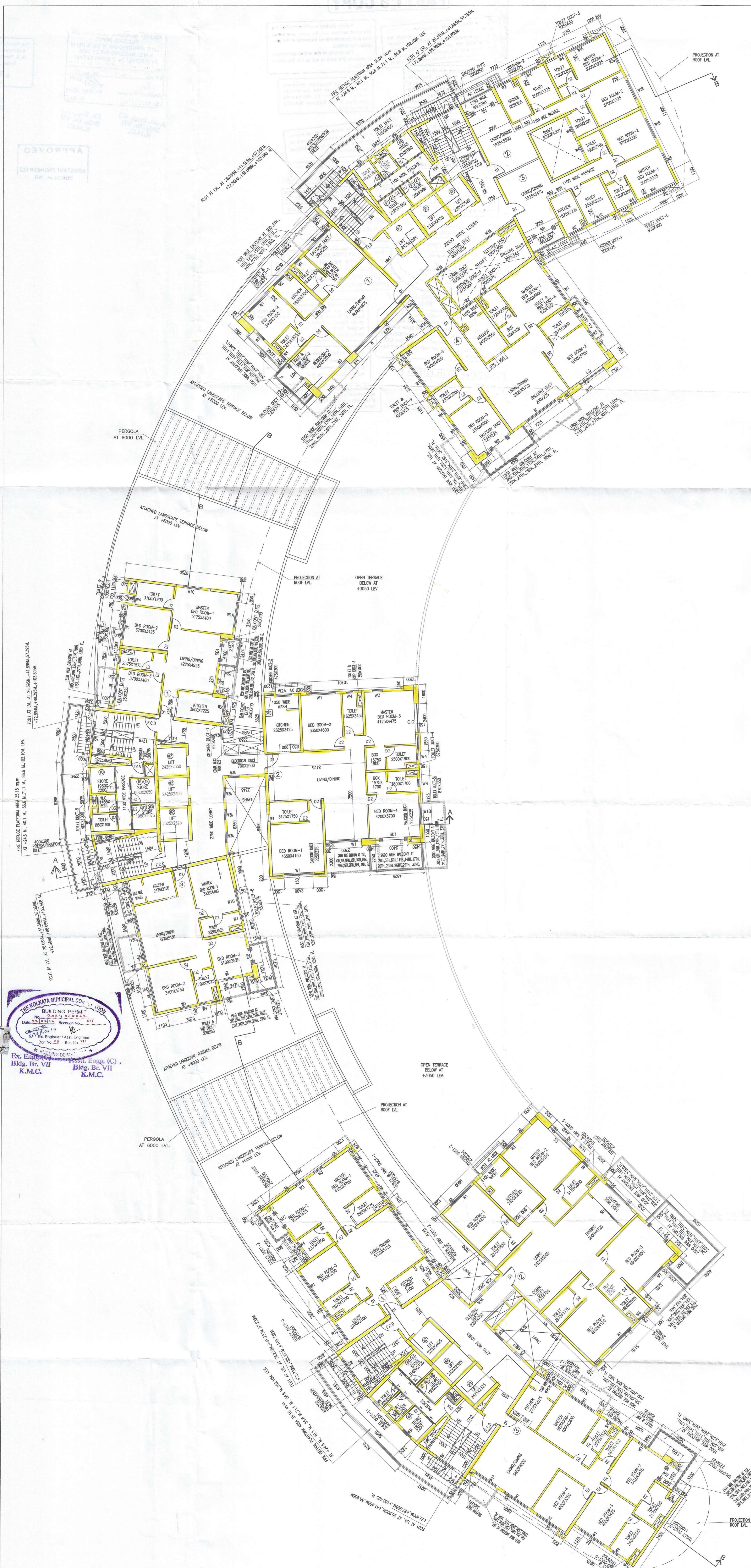
32ND. FLOOR PLAN